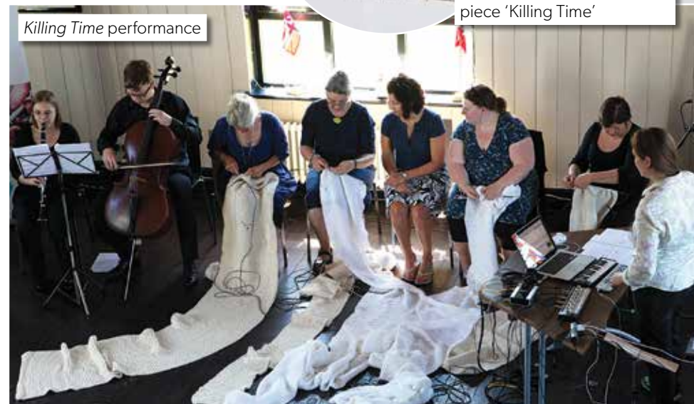
Killing Time performance