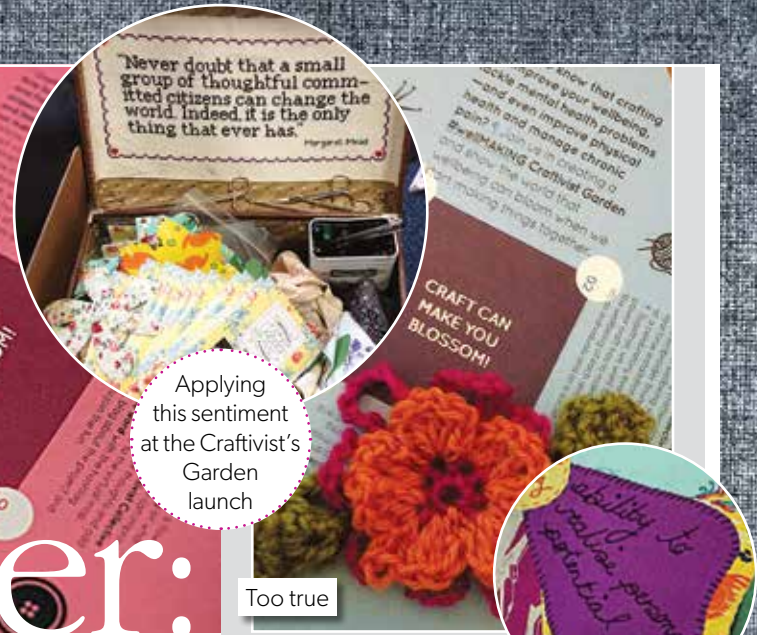
Applying this sentiment at the Craftivist's Garden launch

It might not make you burst into song, but should prove conclusively that craft is good for you and has the power to improve our society. Gardens will be popping up all over the UK so get involved. Find out more at www.craftivist-collective.com/wellmaking .