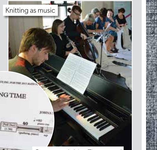
Knitting as music